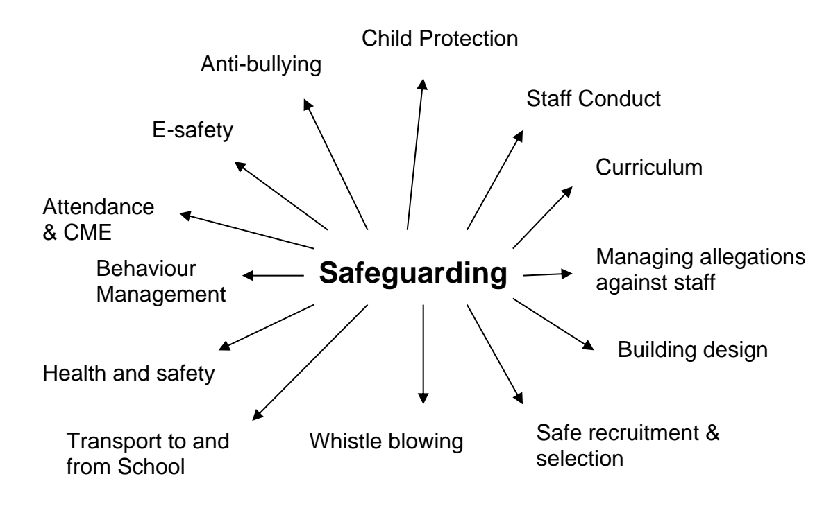
*Annex A: Safeguarding information for school and college staff, is a condensed version of KCSIE Part 1. It can be provided (instead of Part one) to those staff who do not directly work with children, if the governing body think it will provide a better basis for those staff to promote the welfare and safeguard children.

The school is committed to safeguarding and promoting the well being of all of its pupils. Each pupil's welfare is of paramount importance. We recognise that some children may be especially vulnerable to abuse, especially those with identified special educational needs and/or a disability (SEND). We recognise that children who are abused or neglected may find it difficult to develop a sense of self worth and to view the world in a positive way. Whilst at school, their behaviour may be challenging. We recognise that some children who have experienced abuse may harm others. We will always take a considered and sensitive approach in order that we can support all of our pupils. The diagram below indicates what we consider under the umbrella of safeguarding and indicates some of the other policies that relate to safeguarding. The school ensures that all policies are cross-referenced and reviewed annually. All policies are available to staff, and a register is kept and signed by staff as evidence that they have read, understood and thus agreed to adhere to any policies.